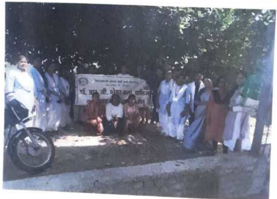
Field visit of students to Sericulture farm